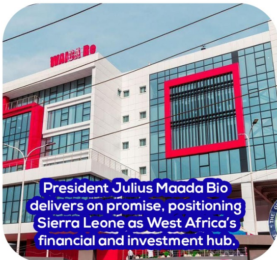
President Julius Maada Bio delivers on promise, positioning Sierra Leone as West Africa's financial and investment hub.