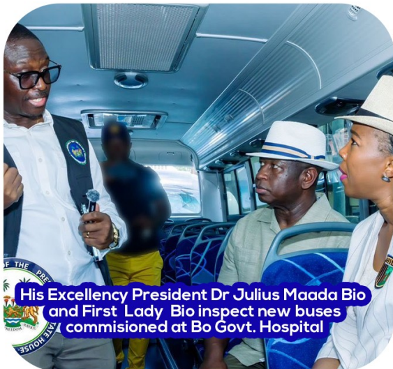
His Excellency President Dr Julius Maada Bio and First Lady Bio inspect new buses commissioned at Bo Govt. Hospital