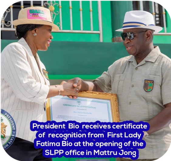
President Bio receives certificate of recognition from First Lady Fatima Bio at the opening of the SLPP office in Matru Jong