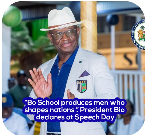
"Bo School produces men who shapes nations." President Bio declares at Speech Day