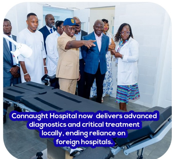
Connaught Hospital now delivers advanced diagnostics and critical treatment locally, ending reliance on foreign hospitals.