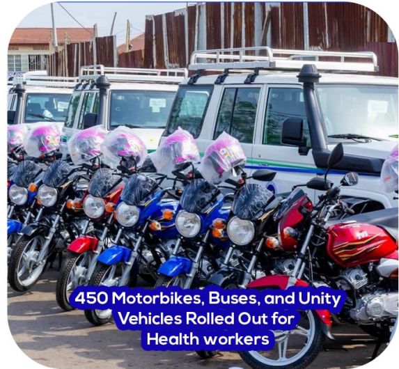
450 Motorbikes, Buses, and Unity Vehicles Rolled Out for Health workers