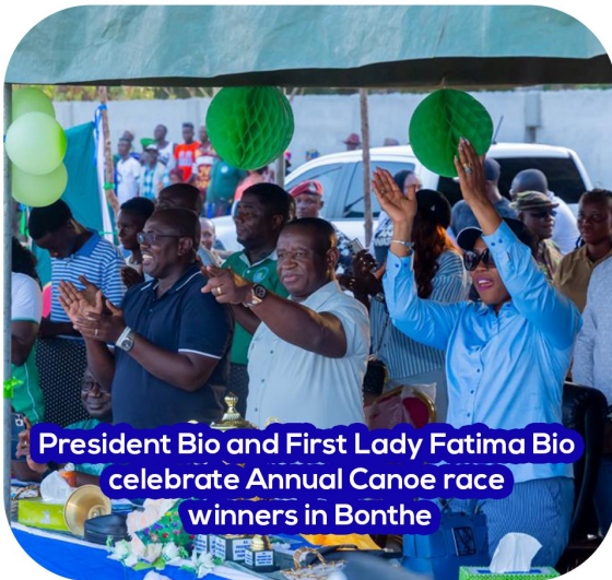
President Bio and First Lady Fatima Bio celebrate Annual Canoe race winners in Bonthe