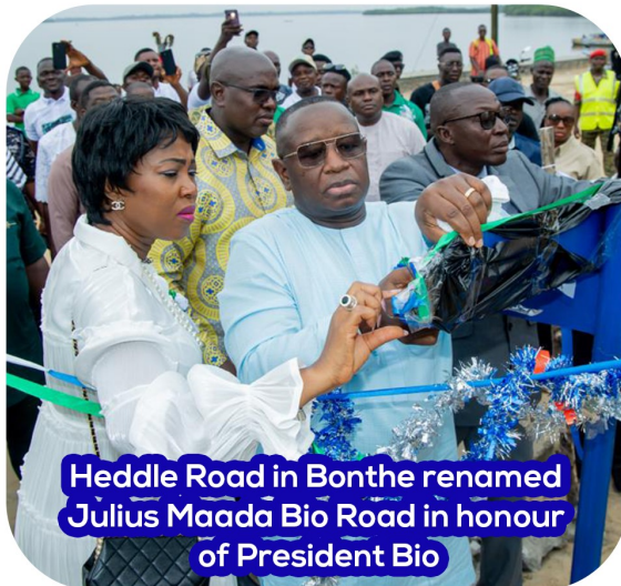
Hedde Road in Bonthe renamed Julius Maada Bio Road in honour of President Bio