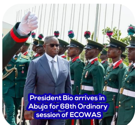
President Bio arrives in Abuja for 68th Ordinary session of ECOWAS