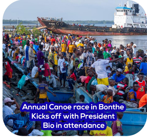
Annual Canoe race in Bonthe Kicks off with President Bio in attendance