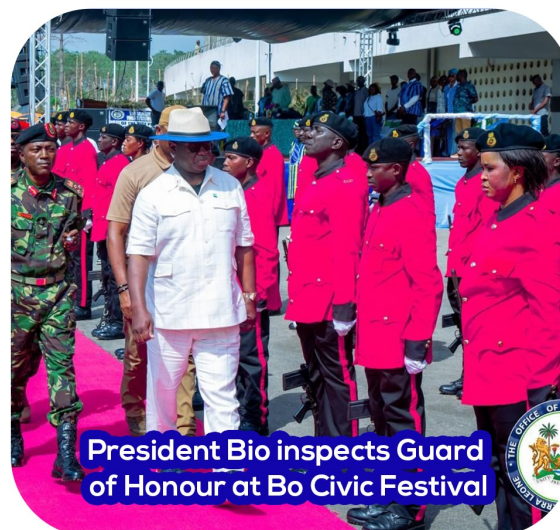
President Bio inspects Guard of Honour at Bo Civic Festival