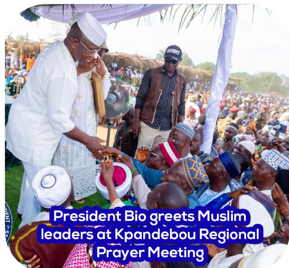
President Bio greets Muslim leaders at Kpandebou Regional Prayer Meeting